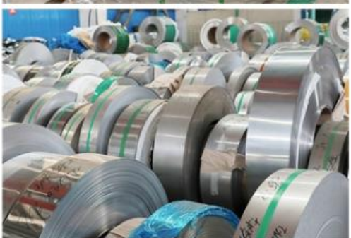
Packing & Delivery